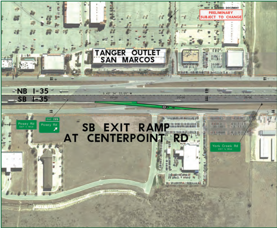
CENTERPOINT ROAD RAMP REVERSAL