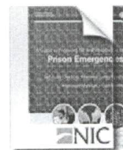
A Guide to Preparing for and Responding to Prison Emergencies...